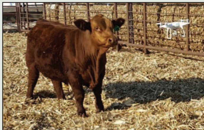
Technology at work...using a drone to get the ears up!