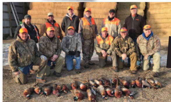
Kummer Guide Service