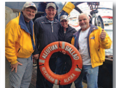
Fishing in Alaska