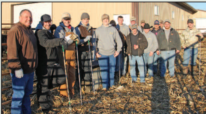
It takes many hands to put on a sale!

Another red bull that combines the Authority X Beef King blood lines. His sire, Authorized, was one of our high selling red bulls two years ago. We like the fact that the T202 cow is incorporated into the pedigree.